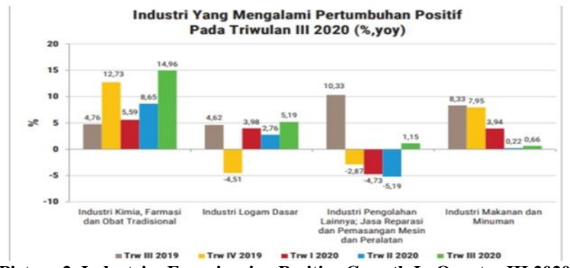
Picture 2. Industries Experiencing Positive Growth In Quarter III 2020

The food business has great opportunities with Jakarta people's continuous increase in per capita expenditure which has significant incremental in the last three years. For this reason, every business owner in the culinary field needs the right strategy for his business.