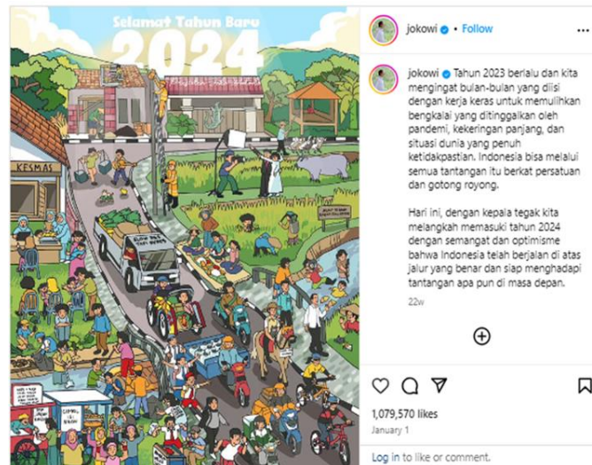
Figure 3. Happy New Year 2024 Greeting Post in Jokowi Instagram

In this study, the researcher wants to analyze the @jokowidodo feed image as of January 1, 2024 which contains Happy New Year 2024 greetings with Ferdinand De Saussure's Semiotics theory. The analysis is carried out as follows: