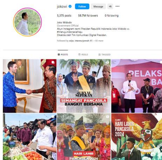
Figure 2. Instagram account @jokowi

Instagram is a social media that is quite phenomenal with various features provided, in addition to functioning to disseminate information. Instagram usage in Indonesia has increased significantly in recent years. According to the We Are Social report, the number of Instagram users in Indonesia reached 104.8 million in October 2023, making Indonesia the country with the fourth most Instagram users in the world (Annur, 2023).