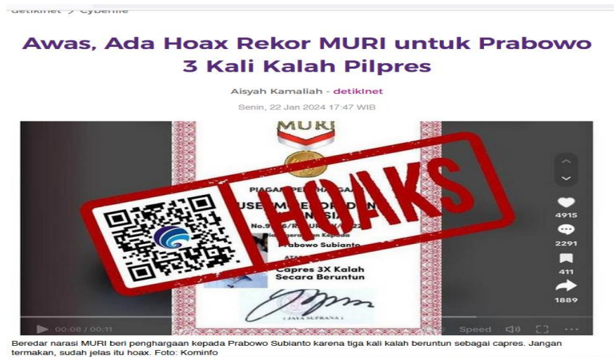
Beredar narasi MURI beri penghargaan kepada Prabowo Subianto karena tiga kali kalah beruntun sebagai capres. Jangan termakan, sudah jelas itu hoax.

I was born in Jakarta. So in Jakarta, the local language is called Betawi. If a Betawi person faces something like that, he usually answers like this, who are you? In addition, Prabowo also mentioned other residents' terms. He also talked about the advice to him to speak politely. EGP. Do you know what that means? EGP stands for: What do I think? What do I think? Many brothers and sisters in Jakarta gave me advice. Mr. Prabowo, don't talk, Mr. Prabowo talk politely. Don't talk. I am a former soldier. My language is what it is.